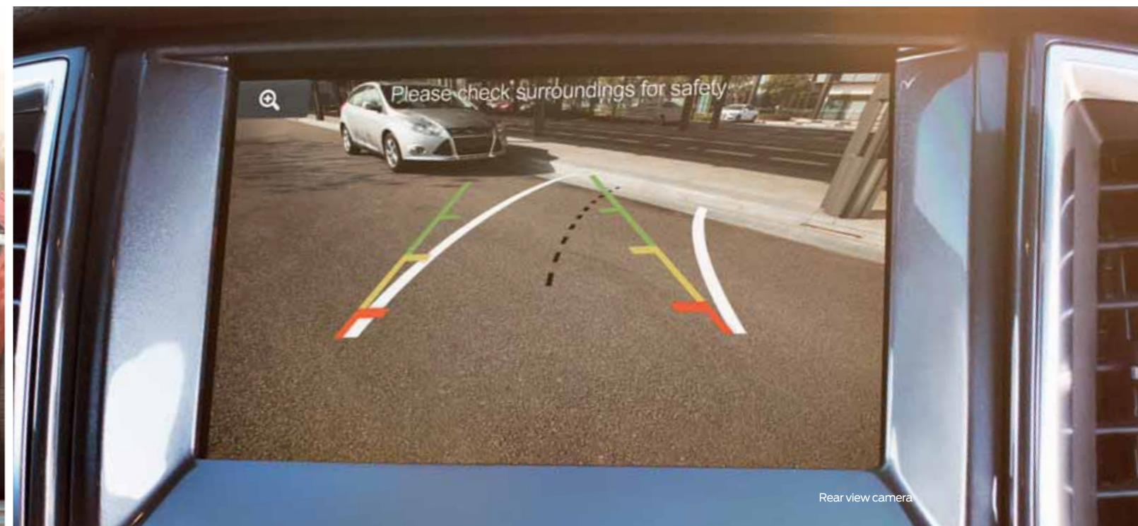
Rear view camera