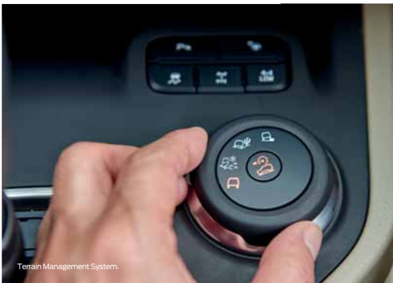
Terrain Management System.