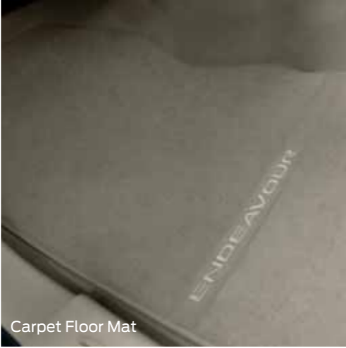
Carpet Floor Mat