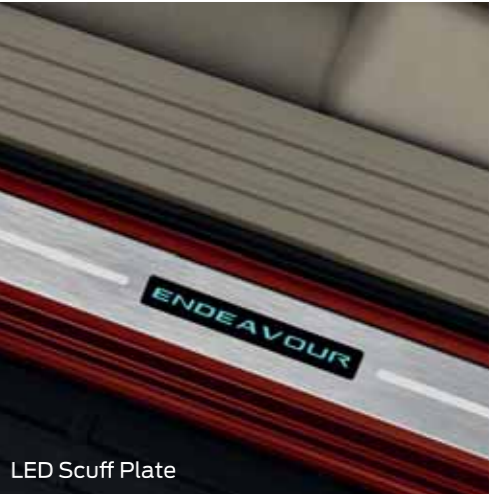
LED Scuff Plate