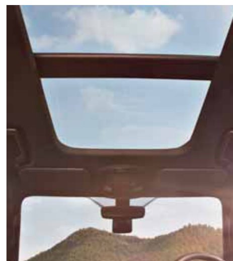
3.2l Titanium shown.