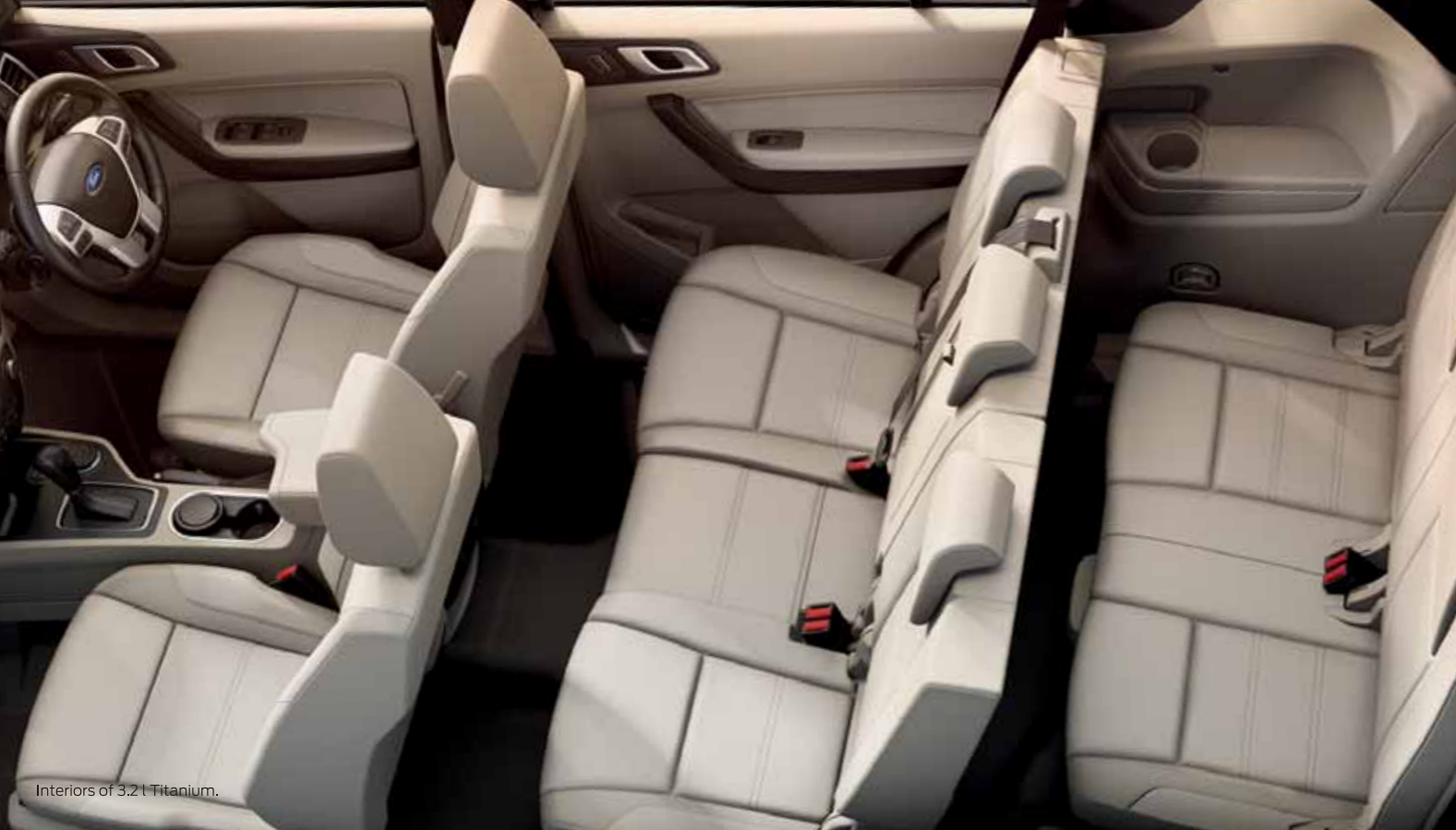
Interiors of 3.2l Titanium.